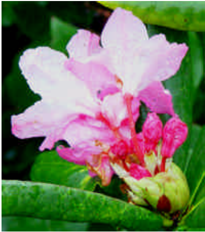
R. macrophyllum photographed March 27, 2003. Not for the early show, but a sure sign of spring.