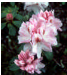
R. 'Mrs. Furnivall'

By the Sea, the 23rd American Rhododendron Society Western Regional Conference Seaside, Oregon - October 2 - 5, 2003 See the next issue of the Journal American Rhododendron Society for details.