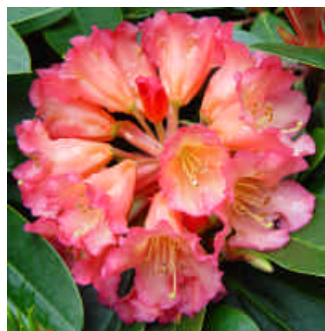
R. 'Unique Marmalade'