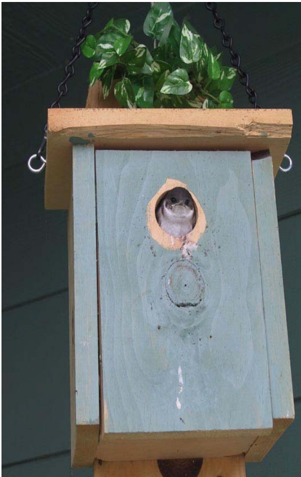
Alpha Baby Waiting To Fledge!

These soaring acrobats of the sky spend their days in groups of 6-8 flying around my neighborhood, consuming thousands of insects and putting on beautiful aerial displays of their flying acrobatics. When the nesting begins, the female is very particular about how the nesting material should be set inside the box and many times throws pieces out the hole if they don't pass inspection! Watch out below! This seems to take forever, but before we know it she is sitting on the nest working on her egg laying. Her spouse and sometimes others of the group bring her food when she is incubating the eggs. The group is usually comprised of non-nesting bachelors and other family members possibly from the previous year's fledging.