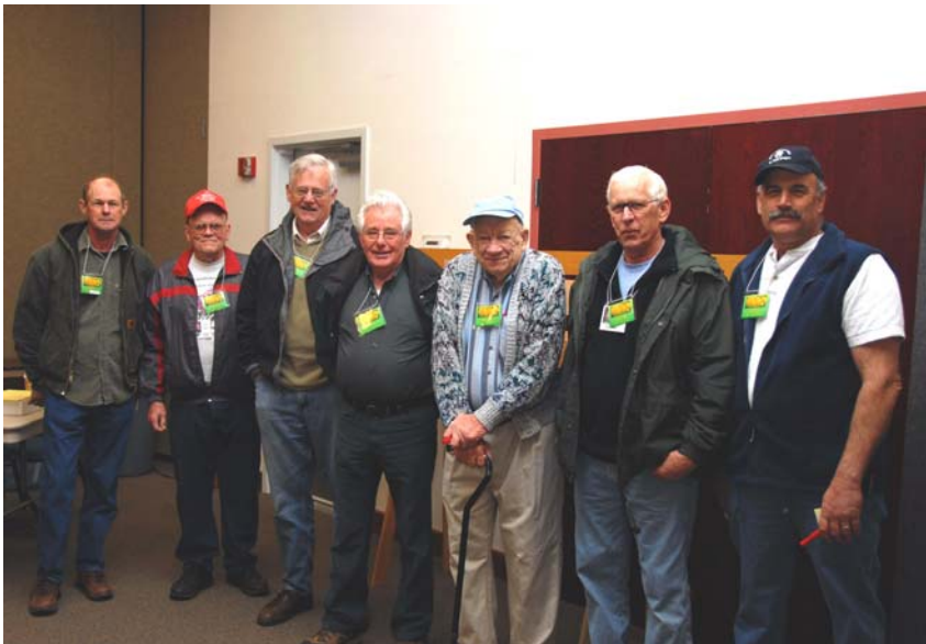
A Few Good Men... Show Judges

BUSHY dwarf has small and VERY GLOSSY foliage. Very Deep green glossy leaves.